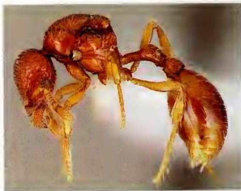
FIGURE 2. Image created using Syncroscopy Automontage software.

Renner and Ricklefs (1994) claim that systematists should not see themselves as "service providers", for this will take away from the intellectual validity of the discipline and sap it of it